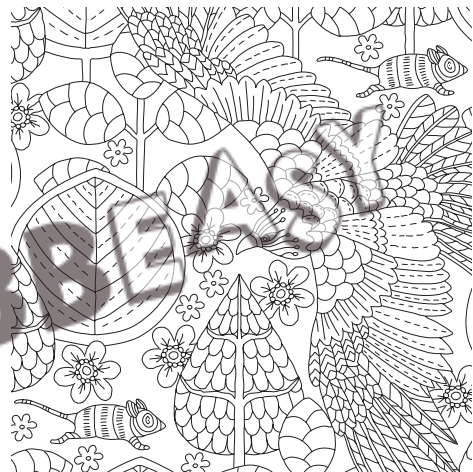
Bird of Prey - Mice