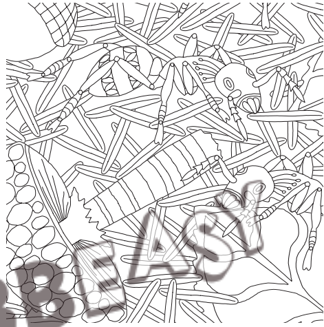
Ants - Acorns