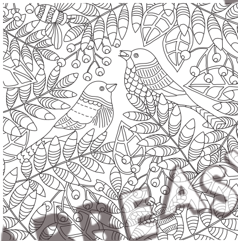
Birds - Ash Tree