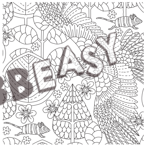
Bird of Prey - Mice