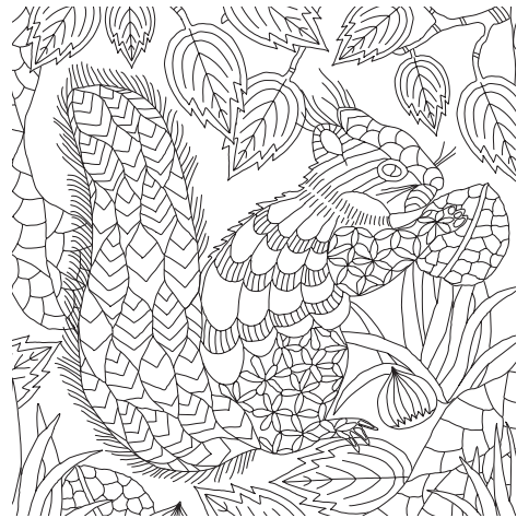
Squirrel - Nuts