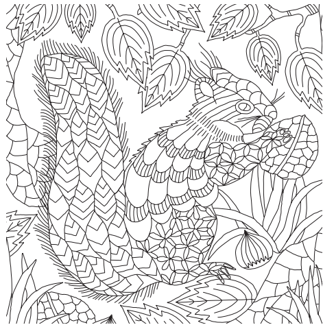
Squirrel - Nuts