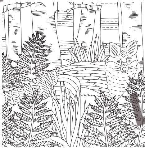
Fox - Ferns