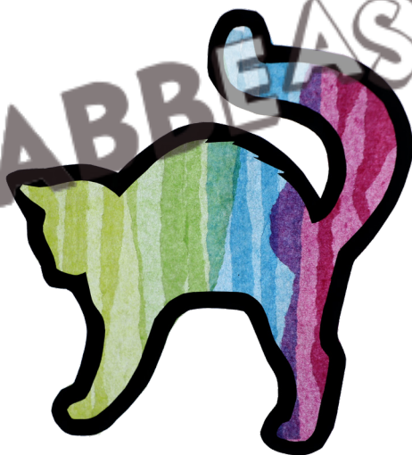
CAT Pages 13 + 21