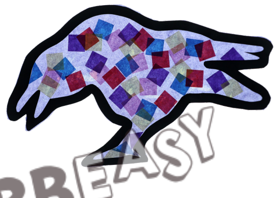
RAVEN Pages 14 + 22