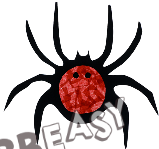
SPIDER Pages 10 + 18