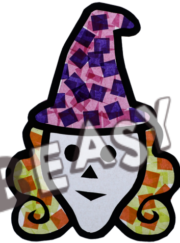
WITCH Pages 12 + 20