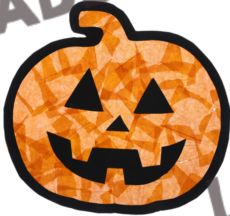
JACK-O-LANTERN Pages 7 + 15