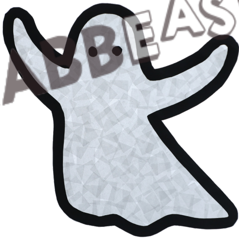
GHOST Pages 9 + 17