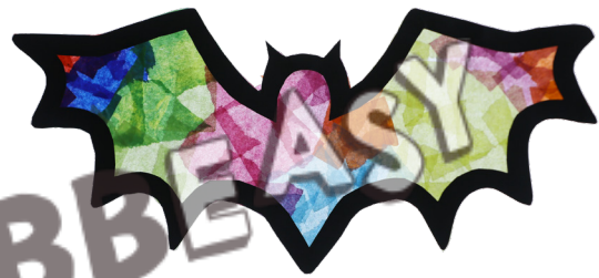
BAT Pages 8 + 16