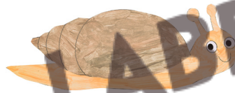
SNAIL (Brumation) Page 15