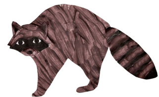
RACCOON (Torpor) Page 13