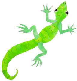
LIZARD (Brumation) Page 8