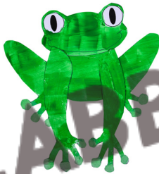
TREE FROG (Brumation) Page 11