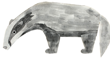
BADGER (Torpor) Page 6