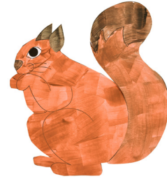
SQUIRREL (Torpor) Page 7