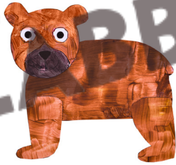
BROWN BEAR (Torpor) Page 5