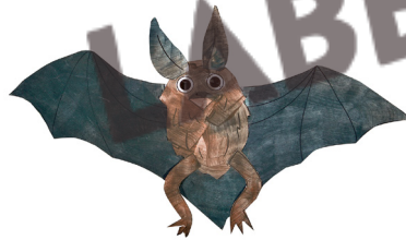
BAT (True hibernation) Page 9