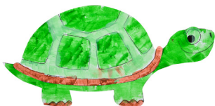
TURTLE (Brumation) Page 14