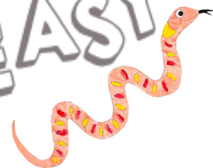
GRASS SNAKE (Brumation) Page 16