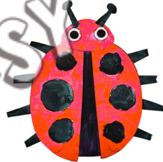
LADY BUG (Brumation) Page 12