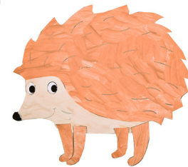
HEDGEHOG (True hibernation) Page 10