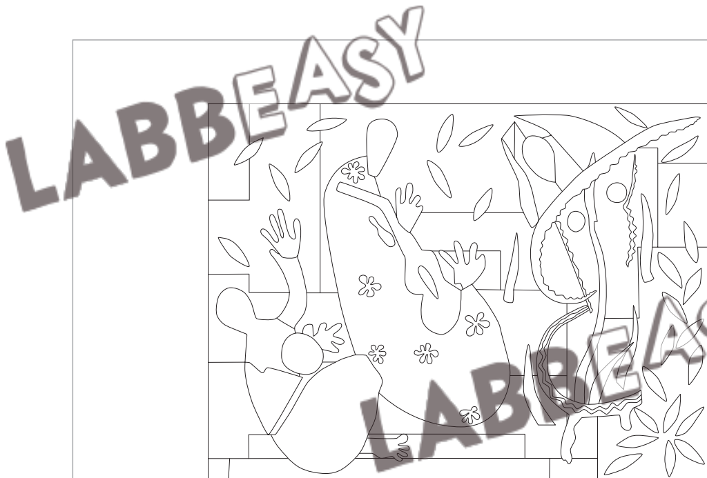
After Henri Matisse "The Sorrows of the King" www.labbeasy.com