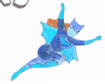
BATGIRL - FLYING Page 6