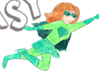
SUPERGIRL - FLYING Page 12