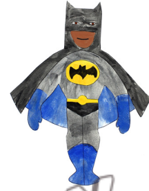
BATMAN Page 7