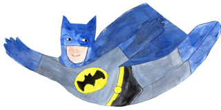
BATMAN - FLYING Page 8