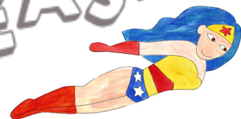
WONDERWOMAN - FLYING Page 16