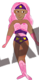
WONDERWOMAN Page 15