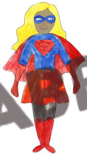
SUPERGIRL Page 11