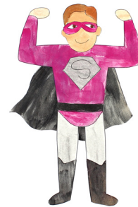
SUPERMAN Page 13