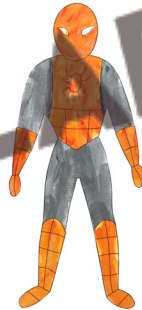
SPIDERMAN Page 9