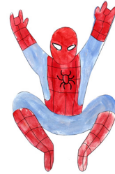
SPIDERMAN - LEAPING Page 10