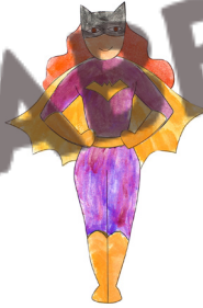
BATGIRL Page 5