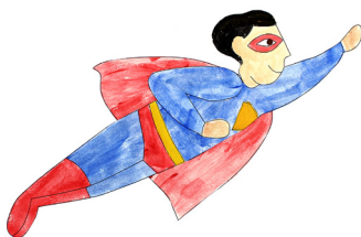
SUPERMAN - FLYING Page 14